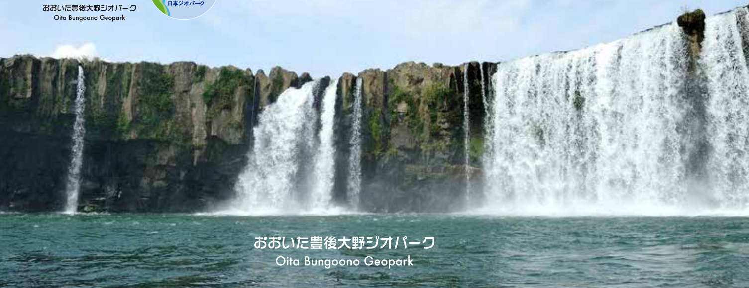
おおいた豊後大野ジオパーク Oita Bungoono Geopark